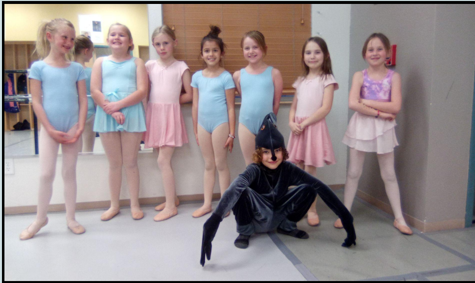
“In my own little corner” Cinderella’s Mice friends (Show 3 -Saturday- ONLY):